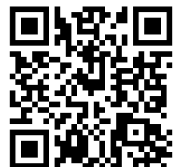
E-Warranty QR Code