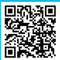
E-Warranty QR Code